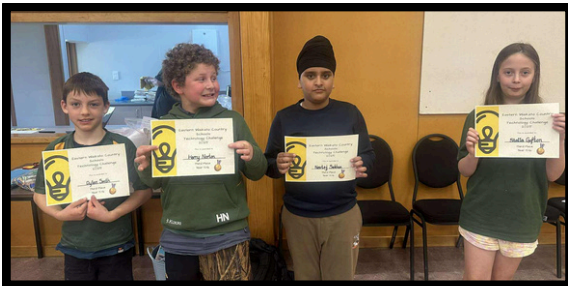
Year 5 & 6 3 rd place getters