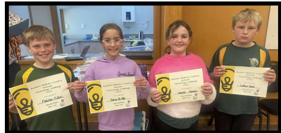
Year 5 & 6 2 nd place getters