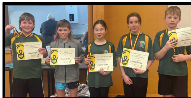
Year 7 & 8 1 st place - 2025 Champions!!